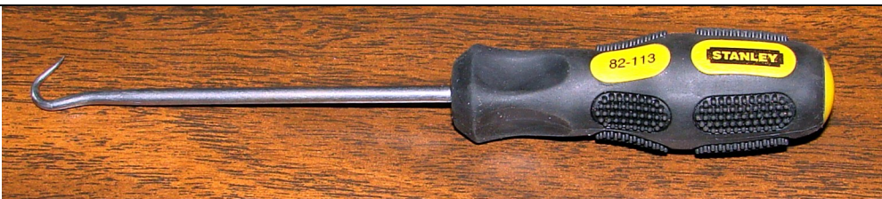
Pick/ Hook Tool

Pick/ Hook tool is used to take out O-rings or pick apart other things